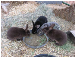
Peter, Mary, Jack (still with us) & Paul

Not only were they adopted to a very loving bunny knowledgeable home but they were all adopted together! They just came to “look at one, maybe two,” they said. But they could not break up the threesome and break their bond. We were so happy when we heard that because we still have Jack and Digger, two of our senior bunnies, to keep each other company even with three adopted. So it all worked out for the very best! Most recent update looks like they are having a ball!!